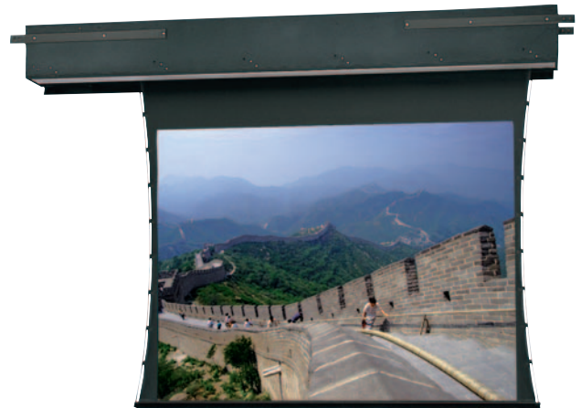
All fabrics will be seamless.